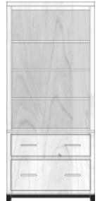
HO6539 38.125W | 40.25W With optional Metro Legs (CAPL50) 82.5H