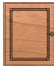
(44) BRIGHTON HARBOUR