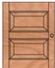
(17) MILL CREEK