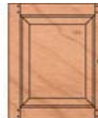
(51) AMERICAN TRADITIONS