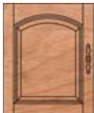
(06) WYNDHAM HILL