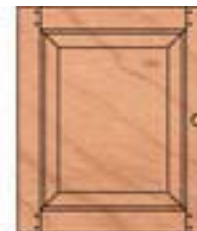
(51) AMERICAN TRADITIONS