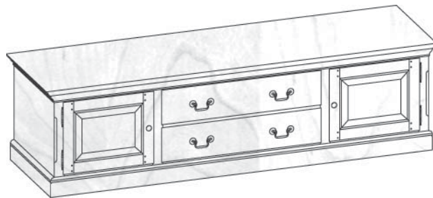
(51) American Traditions shown, over for other styles