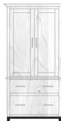
EC6565 40.125W | 42.25W Optional Metro Legs: CAPL50 78.5H