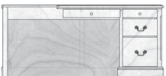
HO51224 L/R 66.8125W | 67.625W