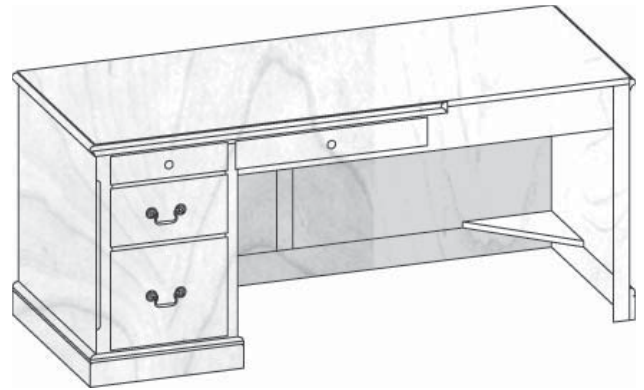
(51) American Traditions shown, over for other styles