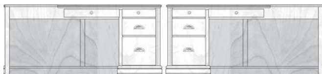
HO20224 L/R 66.8125W | 67.625W