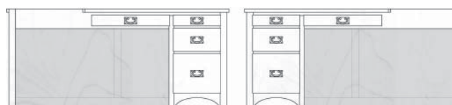
HO54224 L/R 66.6875W | 67.375W