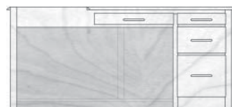
HO65224 L/R 66.9375W | 67.875W