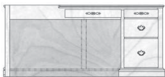
HO06224 L/R 66.8125W | 67.625W