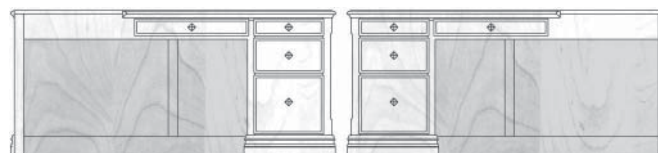
HO44224 L/R 66.8125W | 67.625W