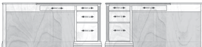
HO11224 L/R 66.8125W | 67.625W