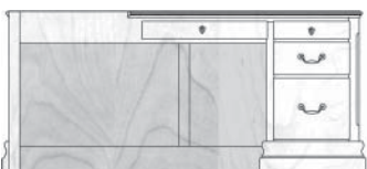
HO33224 L/R 67.125W | 68.25W