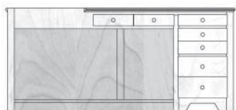
HO17224 L/R 66.625W | 67.25W