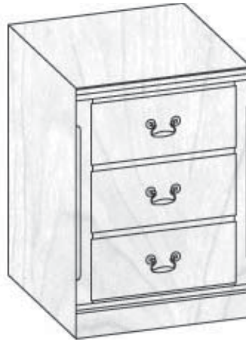
(51) American Traditions shown, over for other styles