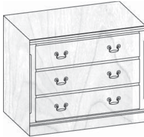
(51) American Traditions shown, over for other styles