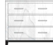
HO65405 36.9375W | 37.875W Optional Metro Legs: CAPL50 32.5H