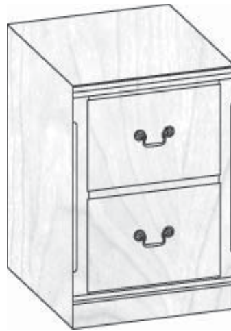
(51) American Traditions shown, over for other styles