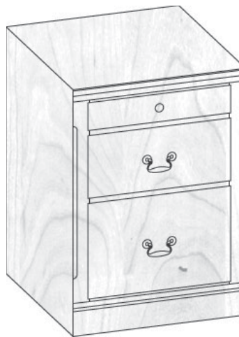
(51) American Traditions shown, over for other styles