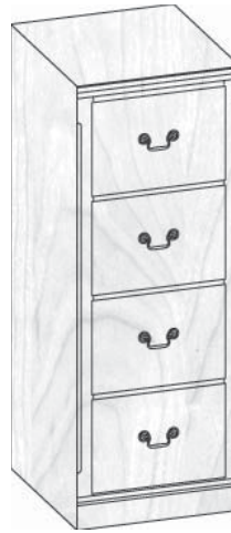
(51) American Traditions shown, over for other styles