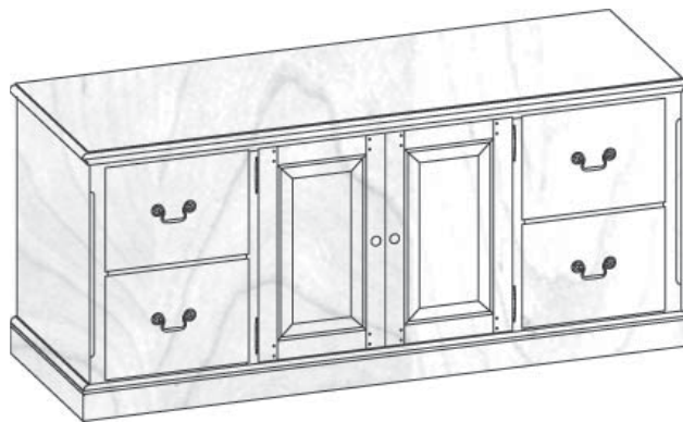
(51) American Traditions shown, over for other styles