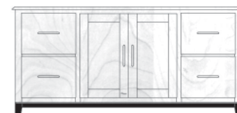
HO65424 66.9375W | 67.875W Optional Metro Legs: CAPL20 32.5H