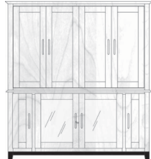
HT65089 59.75W | 61W Optional Metro Legs: CAPL70 67.25H