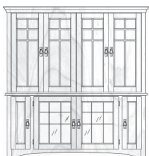
HT54089 60.125W | 61.75W Shown with optional Mission Glass.