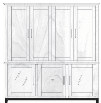
HT65091 67.75W | 69W Optional Metro Legs: CAPL70 72.25H