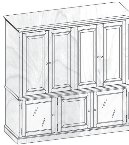
(51) American Traditions shown, over for other styles