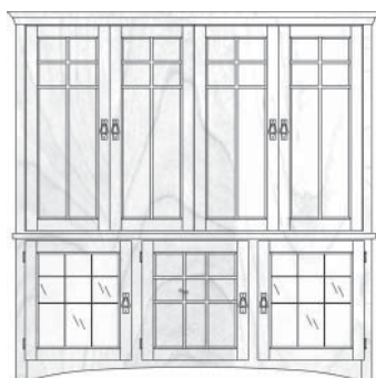
HT54091 68.125W | 69.75W Shown with optional Mission Glass.