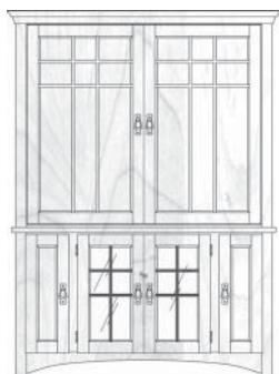
HT54604 49.625W | 51.25W Shown with optional Mission Glass.