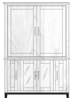
HT65604 49.25W | 50.5W Optional Metro Legs: CAPL50 71.25H