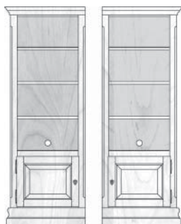
HT33672 L/R 23.625W | 25.25W