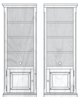
HT51672 L/R 23.625W | 25.25W