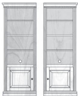
HT20672 L/R 23.625W | 25.25W