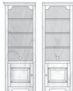
HT17672 L/R 23.625W | 25.25W