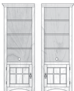
HT54672 L/R 23.625W | 25.25W