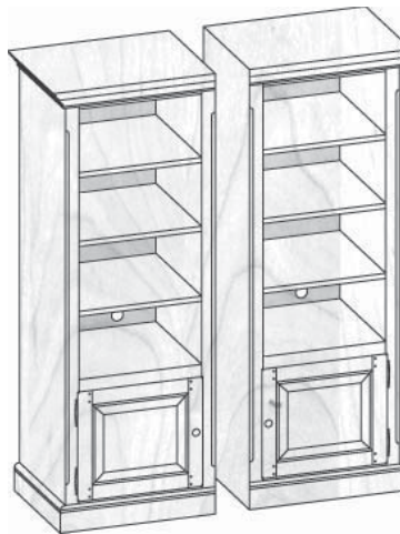
(51) American Traditions shown, over for other styles