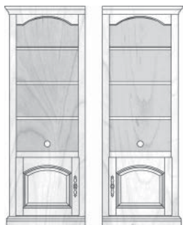
HT06672 L/R 23.625W | 25.25W