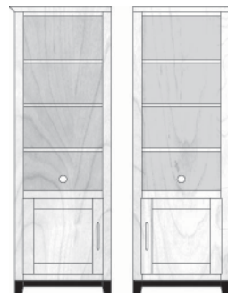
HT65672 L/R 23.25W | 24.5W Optional Metro Legs: CAPL50 67.25H