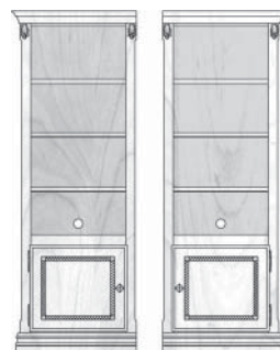
HT44672 L/R 23.625W | 25.25W