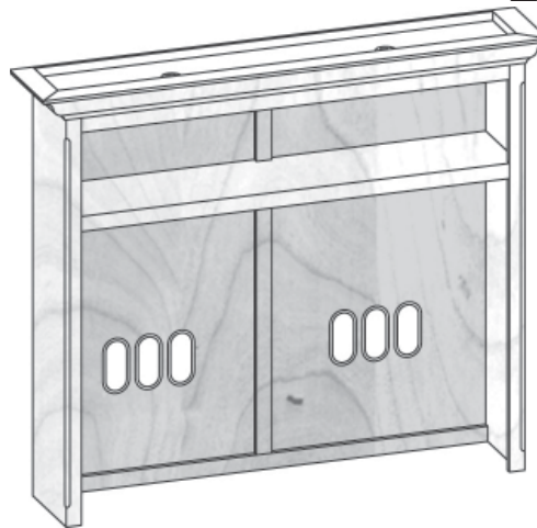
(51) American Traditions shown, over for other styles